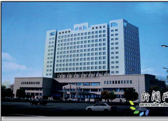
Model of finished Chengxin building

lion RMB worth of transformations. Some have been noticeable, from new seating, to cooking facilities, and a whole new dining floor; others changes are more subtle such as better ventilation, evacuation signaling, and insulation.